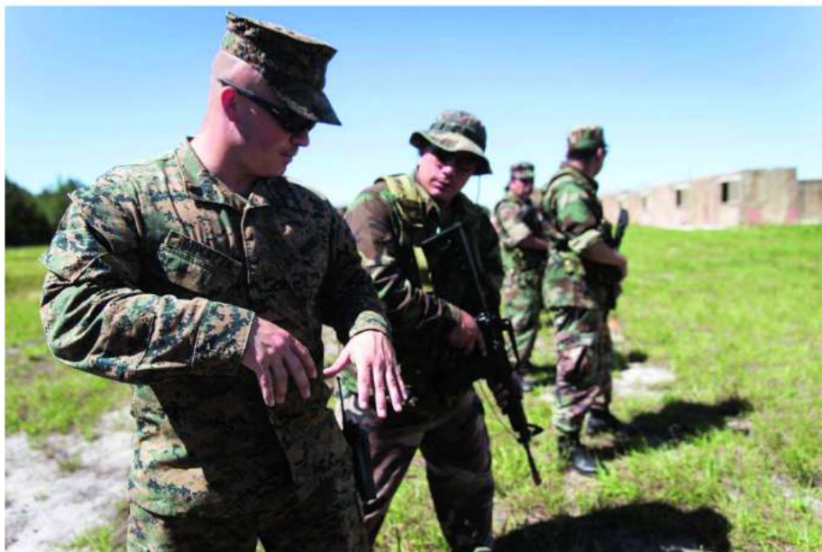
Effective training methods must be employed by U.S. advisors.