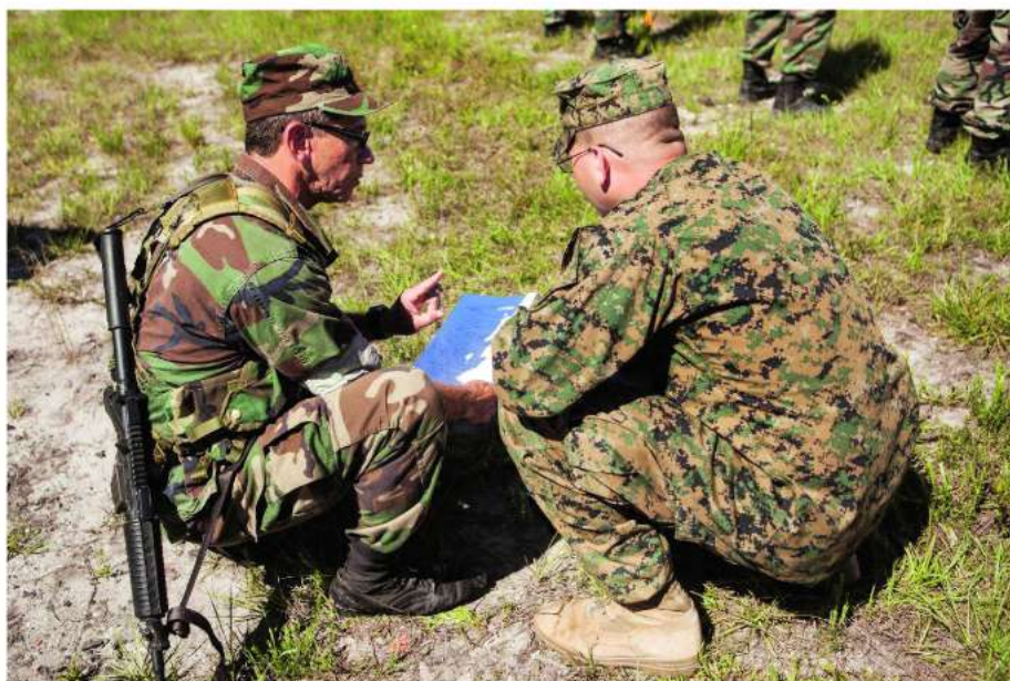
We need to find a way to keep advisor training permanent without constantly “restarting” the lesson.

Combat military advising is frequently treated as a temporary solution to a larger problem. In order to prevent the cyclical process of learning, forgetting, and relearning the effective ways