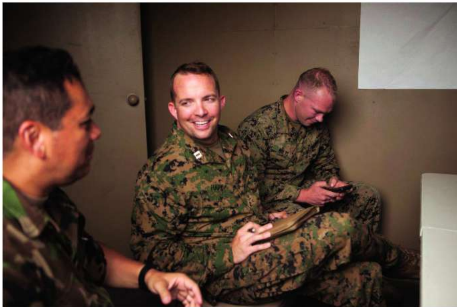
Currently, advisor training is conducted by the Marine Corps Security Cooperation Group prior to the advisor team's deployment.

Division and MEF staffs need to provide articulate advisor training requirements and ensure integration into operational objectives. Picking the right Marine for the job is important, as is building a team. SFA ATs (SFA advisor teams) are especially effective when built around a core of individuals who already know each other. 21 Before assembling a team from the same battalion or regiment, SFA AT requests are initiated by MARFOR commanders. Requests are vetted, scrutinized, and