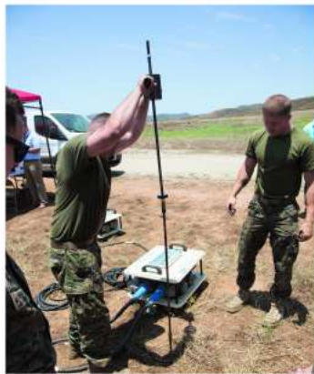
40 Cover Article Marines experiment with C-ULS at Camp Pendleton.